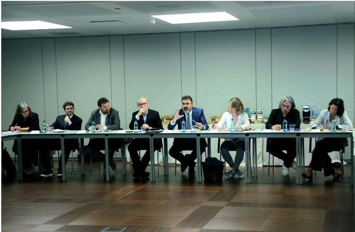
PHOTO 2: Intervention by the president of the Port of Barcelona, Lluís Salvadó, at the Cruise Sustainability Council.